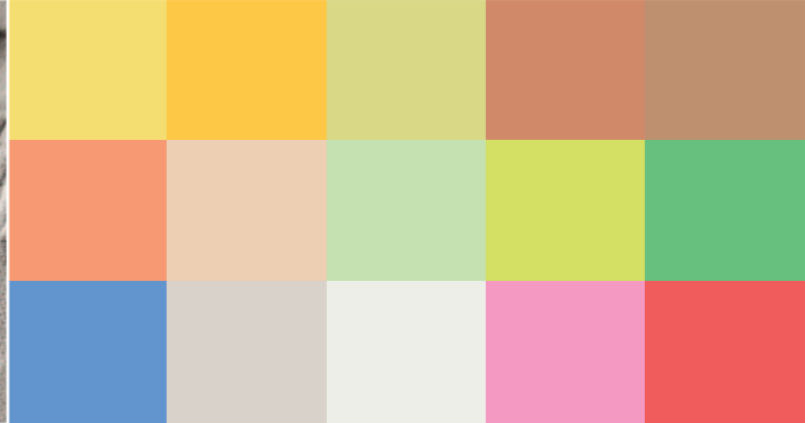
Wide range of pulp colours